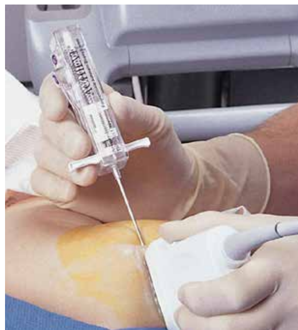
The Achieve® needle's lightweight, one-handed design allows for convenient handling of ultrasound transducer.

Reliable sample retrieval reduces risk of sample loss